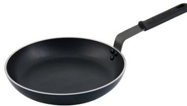
Non-stick frypan with Ezigrip handle