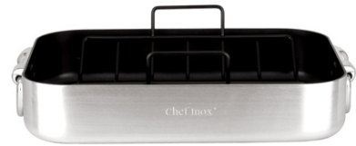
Non-stick roast pan