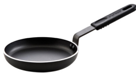
Non-stick blinis pan w Ezigrip hdlc